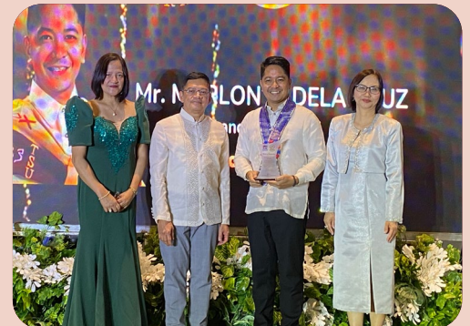
OHRDM director commended with 'mark of recognition' from CSC regional office