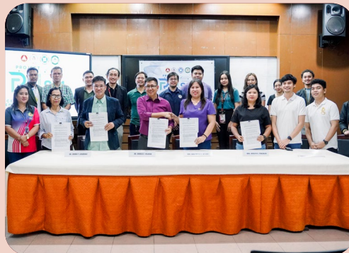
TSU, LGU Anao to work for modernized info system