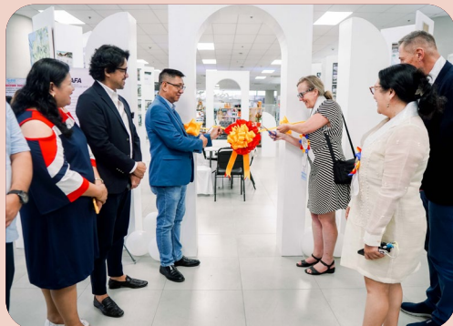
TSU is the first SUC in PH to partner with ISOCARP